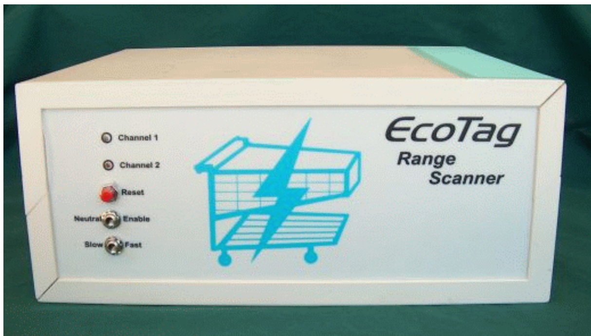
Front panel of RFID-radar

Once the transponder and the reader are locked onto each other, the radar will report the range and bearing of the transponder. The reader is able to detect changes in the range of the transponder of small distances, allowing the radar to