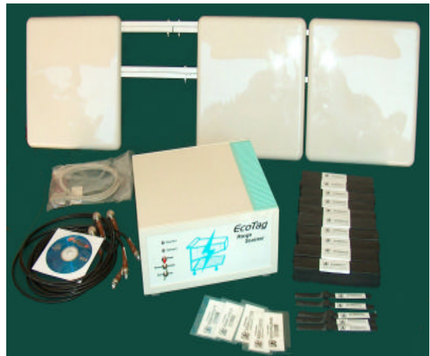
Trolley Scan's new RFID-radar with antenna system for 2D scanning

The system operates in different accuracy modes. The system can measure the absolute position of multiple transponders to tens of centimeter accuracy, or the relative movement of transponders to millimeter precision